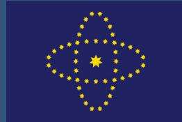
New Federal State of China Since 2020.06.04